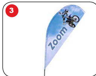
Follow above instructions for pole and graphic assembly.