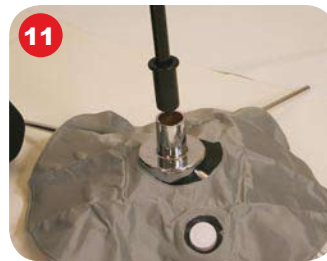
The end of pole with base adapter inserts into the base.