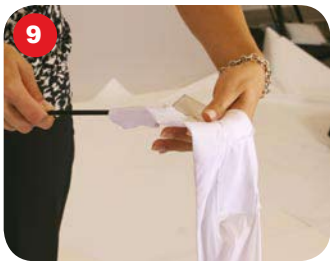
Feed the thin end of pole through the pocket that runs along side of the graphic.