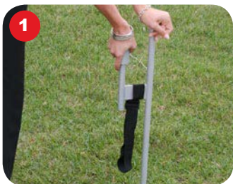
For outdoor use, stake can be inserted into ground.