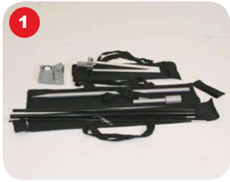
Unpack contents of bag.