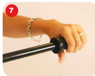
Attach base adapter on one end of large poles.