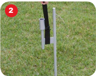
The pole with base adapter inserts into stake.