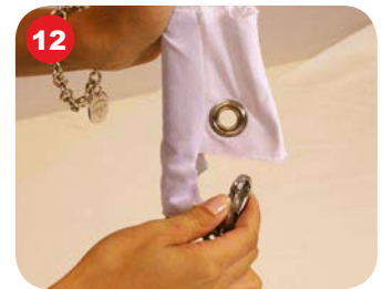
Secure graphic to pole by attaching spring hook to graphic's grommet.