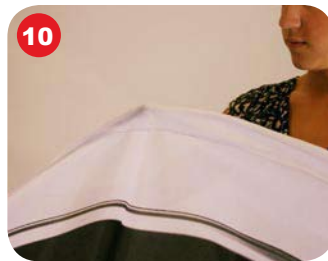
Use caution not to puncture graphic with pole while feeding the pole through the graphic pocket.