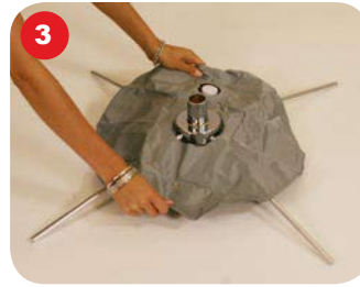
Place base over stand.