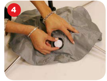
Fill base with water or sand to provide weight.